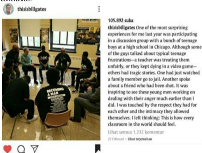
Figure 1. Bill Gates' Instagram Account

The data analysis is, first of all, to answer the research questions. The data are identified and classified by using the following steps. First, the data were analysed using positive politeness strategies based on Brown and Levinson's theory. Second, the analysis consists of the process of classifying the data into two categories, men and women comments. Additionally, the language patterns used by men and women in the comment column are analysed. This process was done to identify the differences that occurred in the comments of different genders. Finally, data were analysed to determine the politeness of gender differences. Afterwards, the researchers interpreted and described the data before presenting the conclusion.